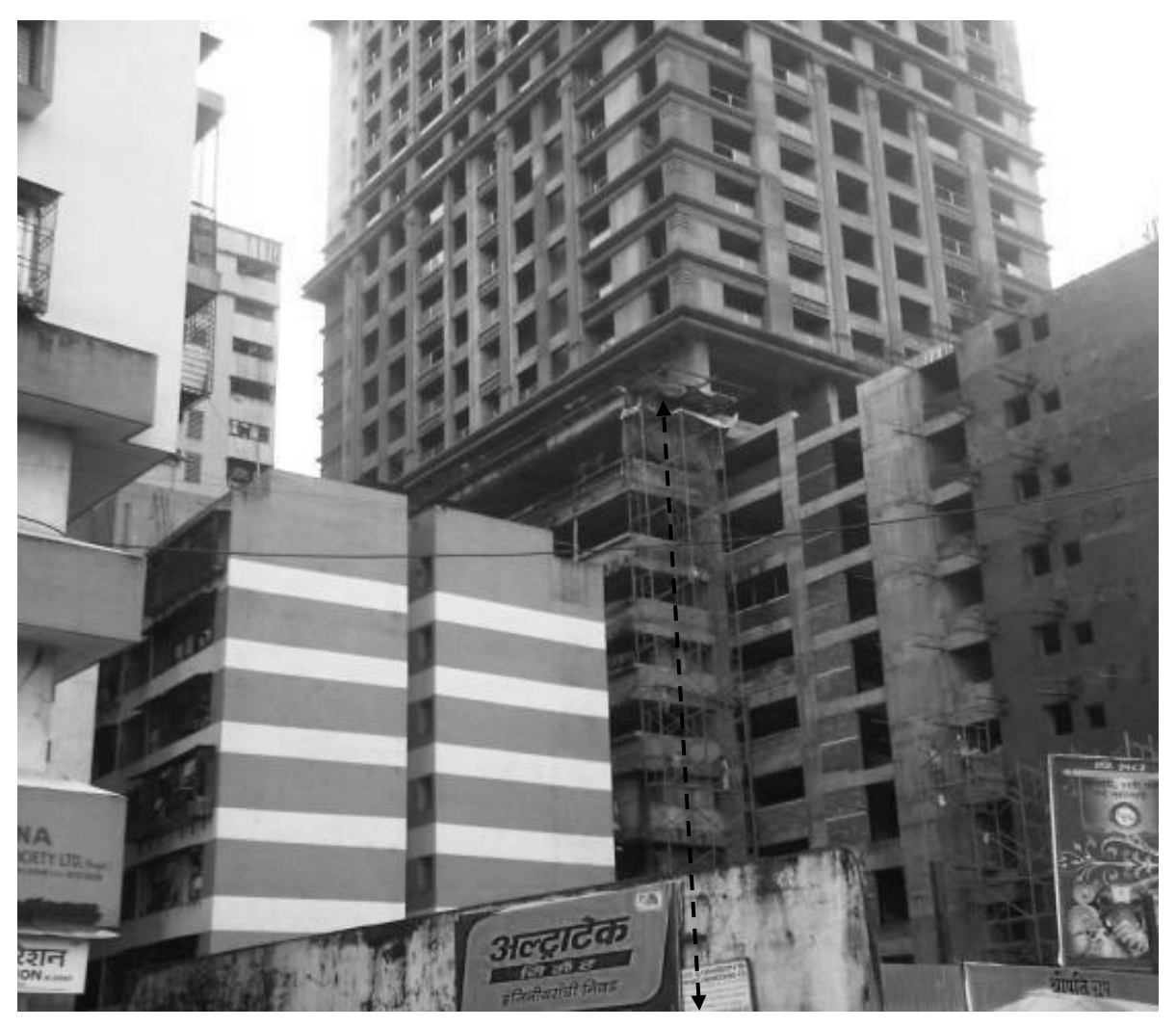
Fig. 2: Rehabilitation building in the centre with parking lots towering up to 7 stories on all three sides Girgaum, Mumbai