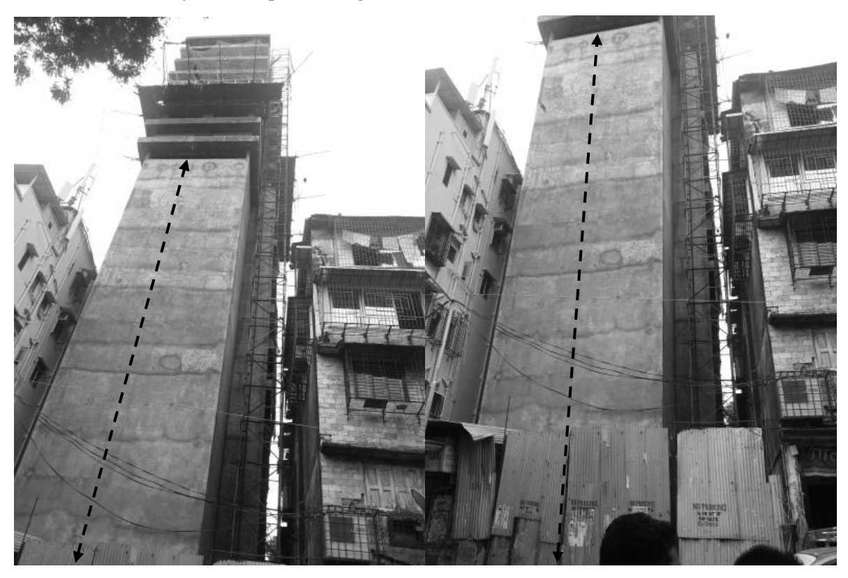
Fig. 3: Multi-level car parking lot towering up to seven stories, Girgaum, Mumbai