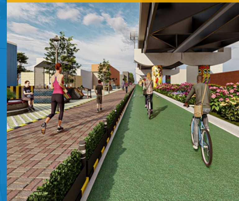
Elevated Railway Track

Akriti Kacker Pavithra Selvam Poulomi Naskar