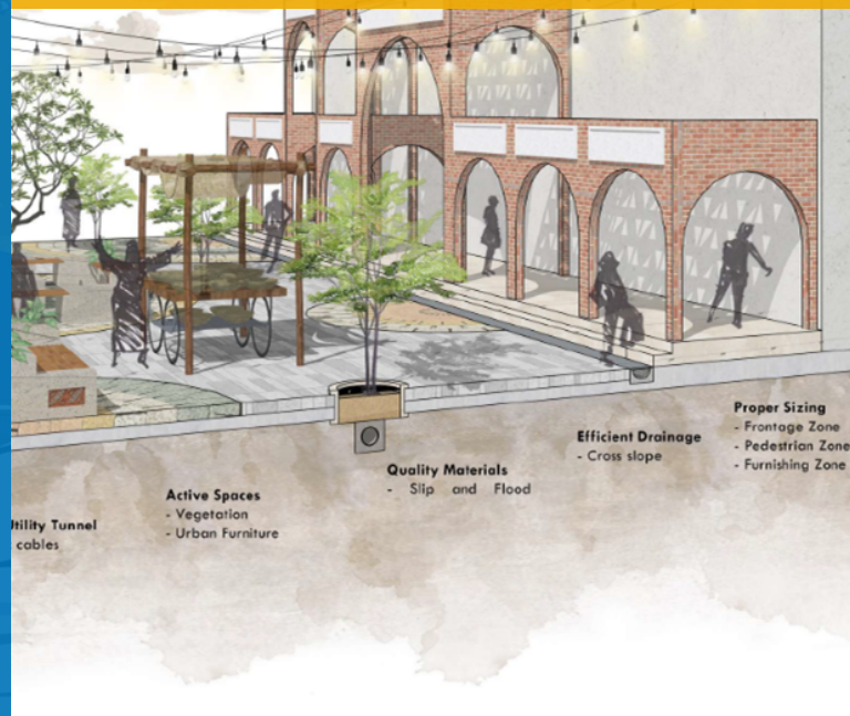
Rohtak Road 1