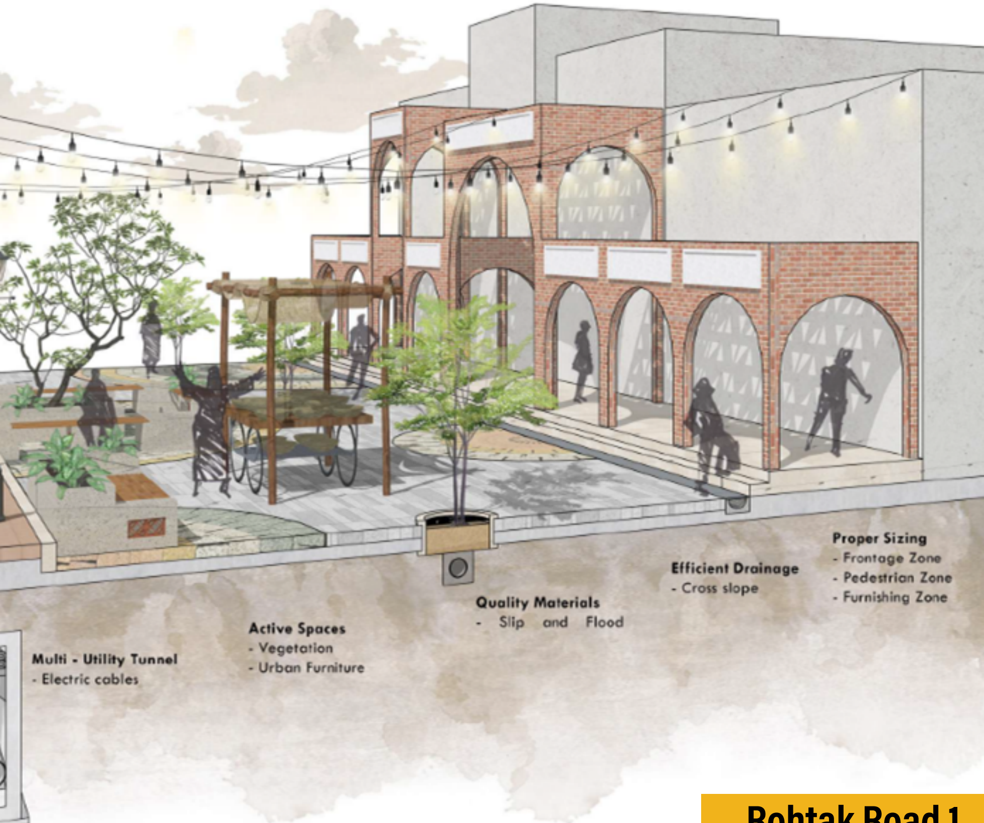
Rohtak Road 1