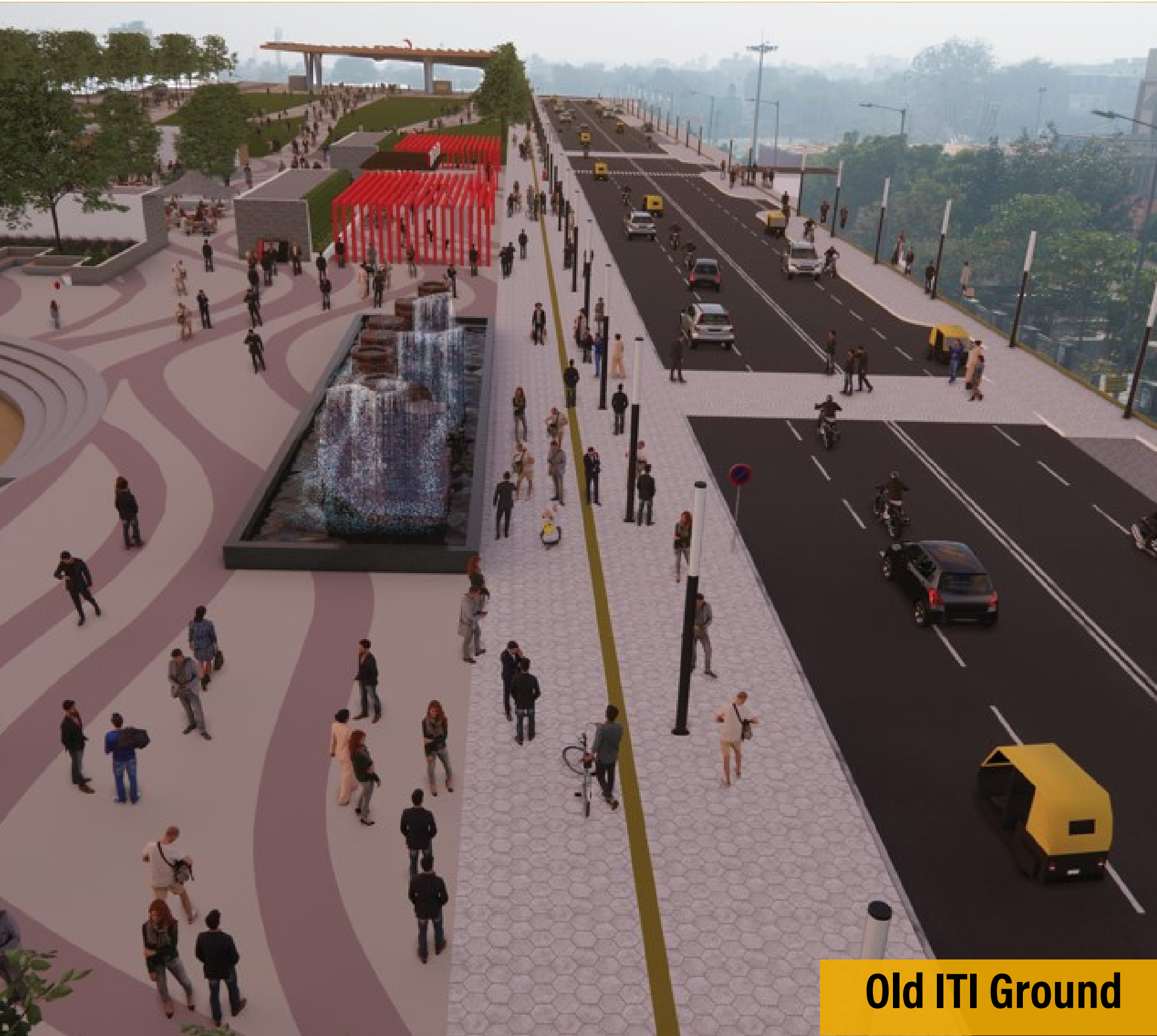
Old ITI Ground