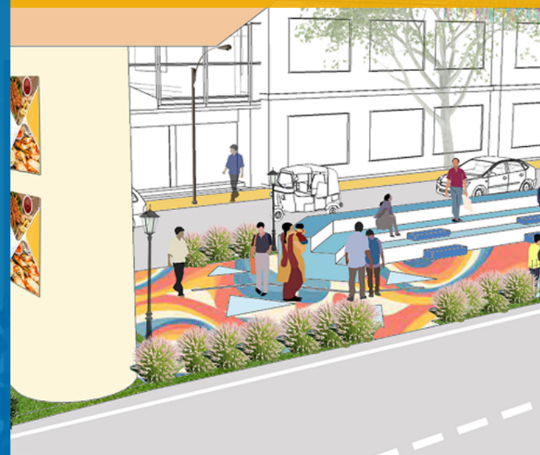
Old Bus Stand Road

Chandrayee Mitra Disha Mukherjee Simran Sheoran