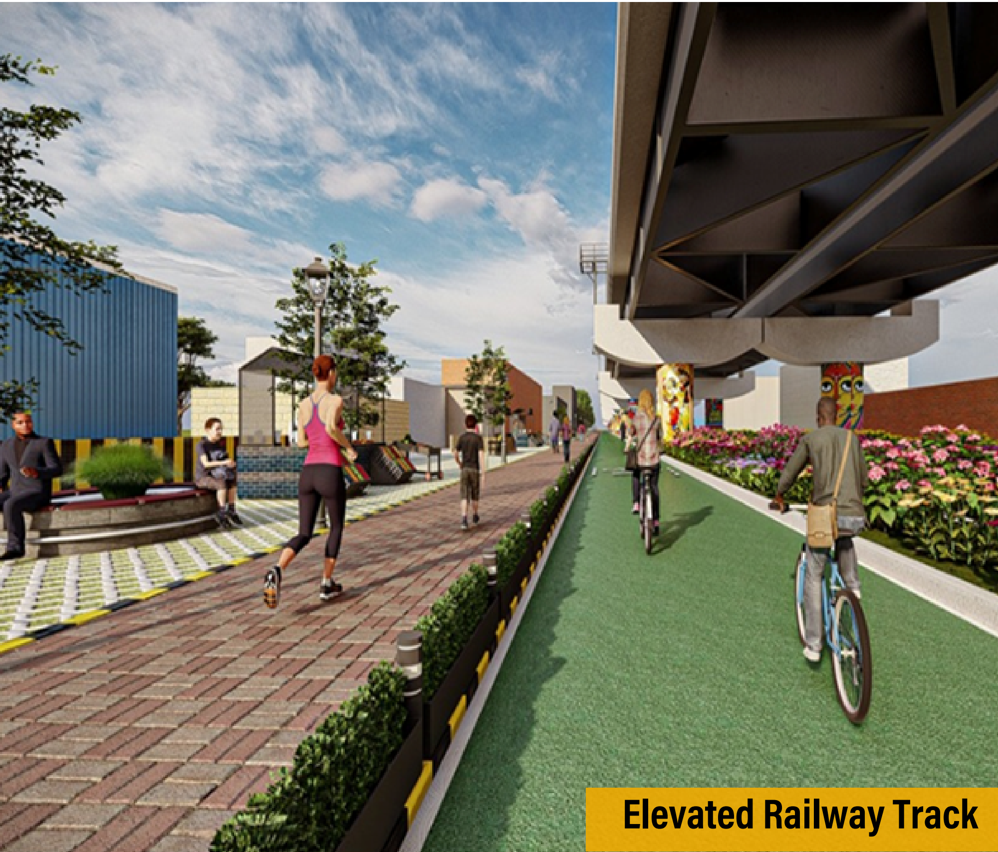
Elevated Railway Track