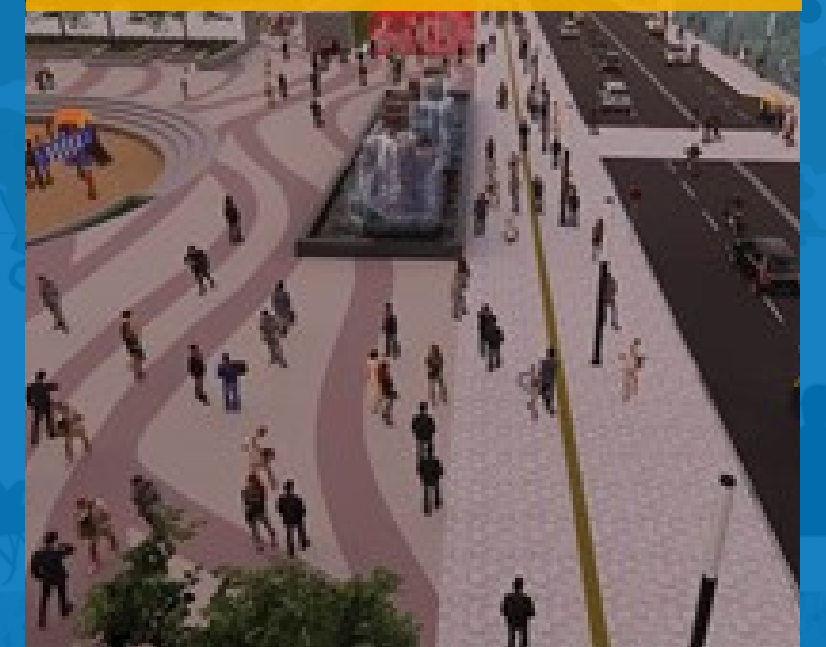
Old ITI Ground

Akriti Kacker Pavithra Selvam Poulomi Naskar